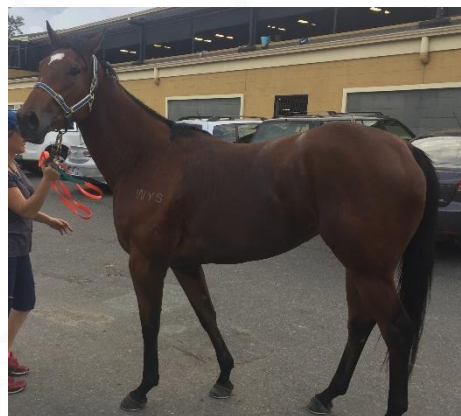
Amore Danza after some recent trackwork

Amore Danza has been toiling hard to get into shape after the long layoff with her abscess. She has been set down to trial in the middle of April. Her wound and subsequent hole in her hoof is all but grown over and she is showing no signs of being hindered by stubborn issue. Getting her to the trials and onto a race will be a welcome relief for her patient owners.