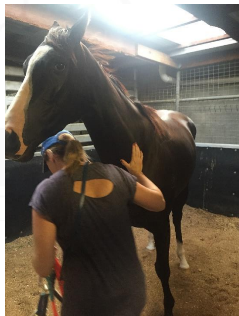
Coolwedge back in the stable

Lucky Clover's first winner Coolwedge has returned to the Edmonds Racing stables to begin her prep to back up her previous successful campaign. The filly looks to have put on some size but also returned in a strange relaxed attitude considering her well known flighty behaviour. The reason for the change in her attitude is unknown, some say it's the royal treatment she received at the Edmonds farm others say it's the new-found confidence from a win and two placings in her last three starts. Whichever it is, the stable staff are ecstatic.