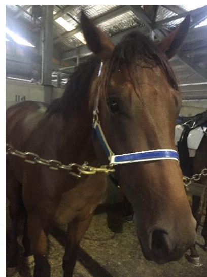
Epplause before his trial