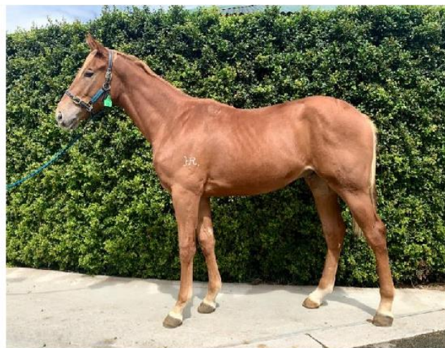
Choisir x Wald Colt after completing his breaking in