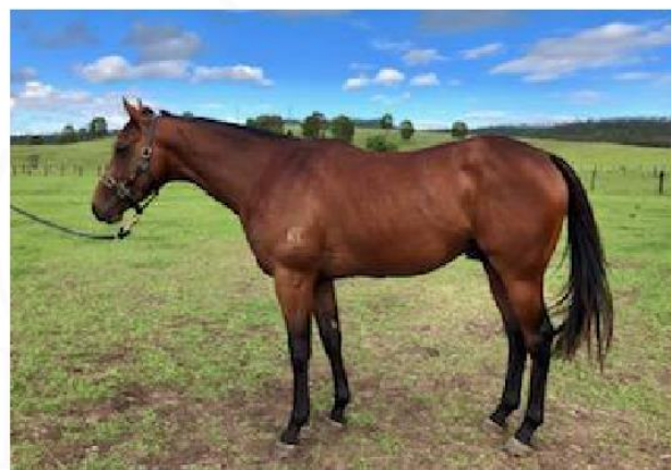
Epplause enjoying the surrounds at Newington Farm

Inglis Sales purchase Epplause has been on his best behaviour while spelling at Canungra's Newington Farm. Employees at the farm are impressed with his great nature and how easy he is to work with. Rumour has it he has received word of his stable mate's operation and is too scared to put a foot wrong. Epplause has been spelling for 30 days now and will be due to return to the stables in the next few weeks.